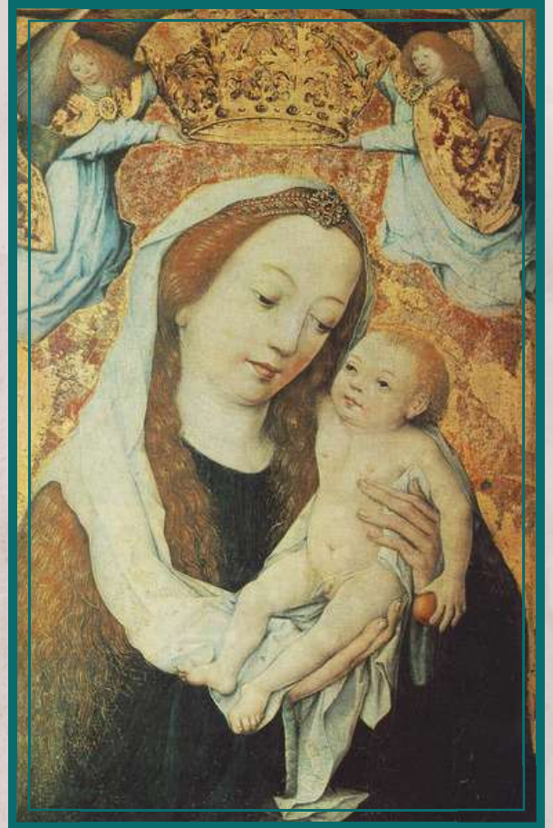
Coronation of Mary. Unknown Artist. 1475-90. Alte Pinakothek, Munich

Following Christ is not for the faint of heart. We must set our eyes on the joy of Heaven and not fear any adversity but trust steadfastly in the Lord who will give us the strength to set our hearts on Him - to "hunger and thirst" for holiness and righteousness in every circumstance. So whether we are having a hard time finishing an assignment or persevering in a new resolution that can lead us closer to God, we can pray to the Holy Spirit for an increase in the virtue of fortitude, striving to imitate Our Lady whose desires were satisfied by God alone.