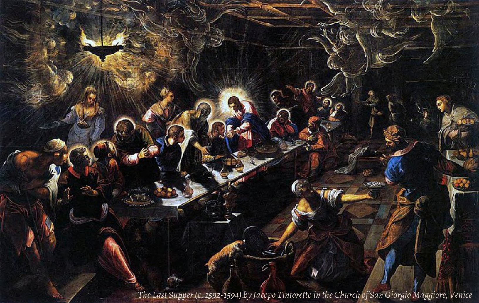
The Last Supper (c. 1592-1594) by Jacopo Tintoretto in the Church of San Giorgio Maggiore, Venice